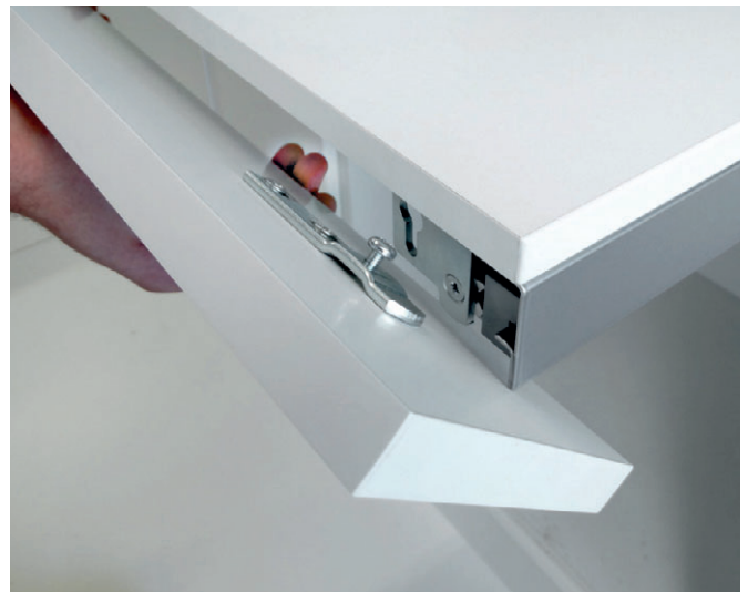
Click front into place and fix it.