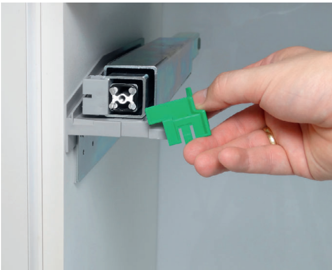
Remove transportation lock.