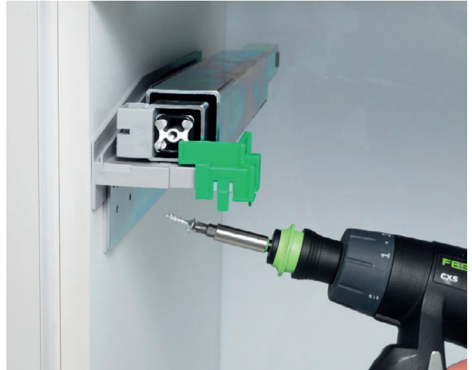
... for easy fixing.